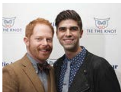
Jesse Tyler Ferguson Hosts Tie the Knot Event