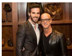
Frye Winter Preview