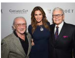
Cindy Crawford Cover Party