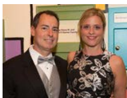
Kohl Children's Museum Gala