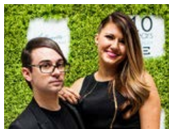
Christian Siriano Celebrates New Fragrance